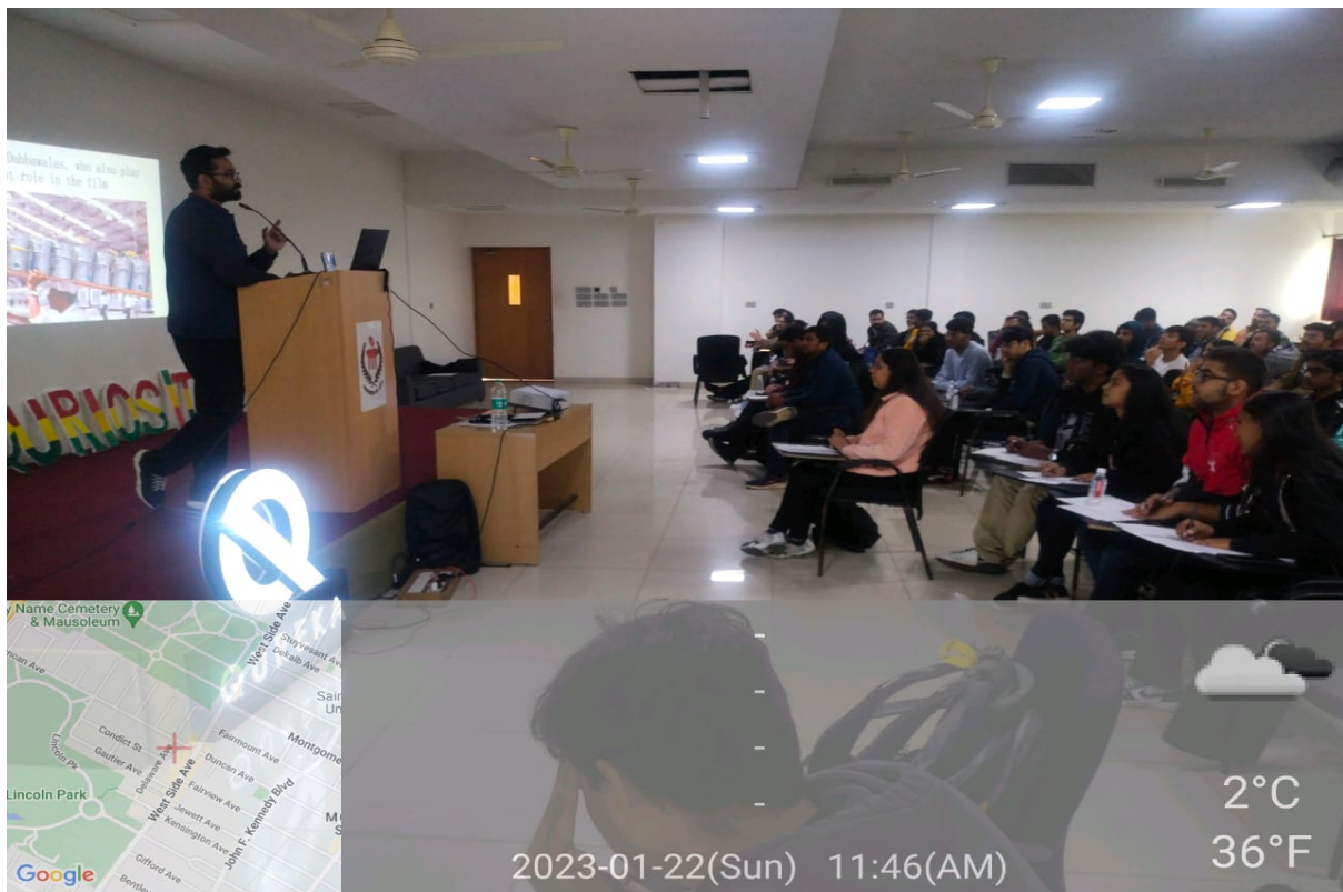
Fig: Participants for the quiz