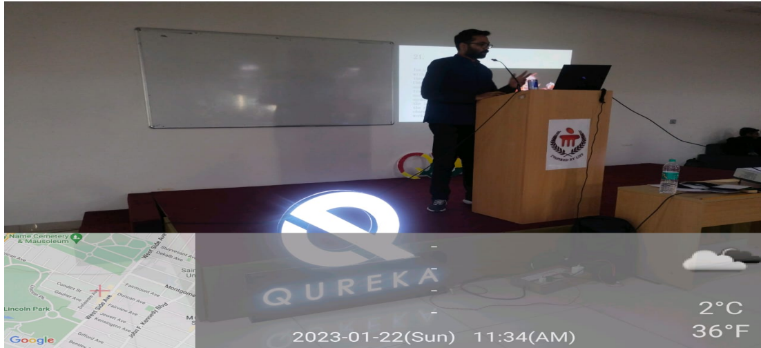
Fig: Quiz master presenting questions.