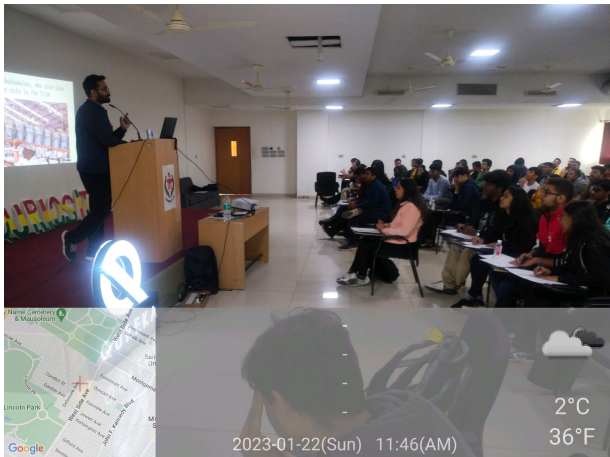
Fig: Participants for the quiz