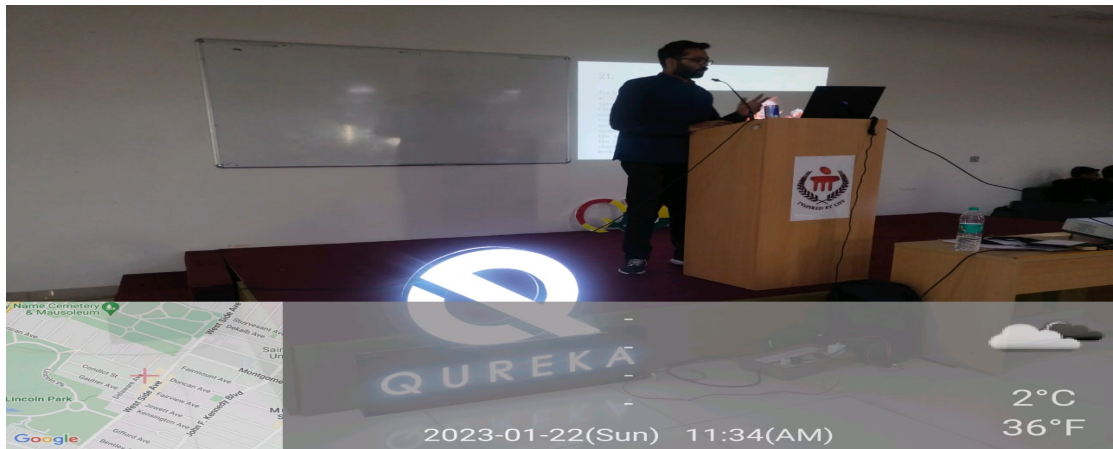
Fig: Screen projected for questions.