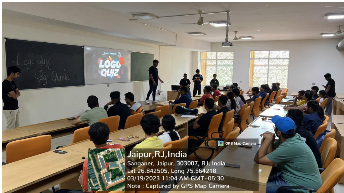
Fig: ParAcipants for the quiz